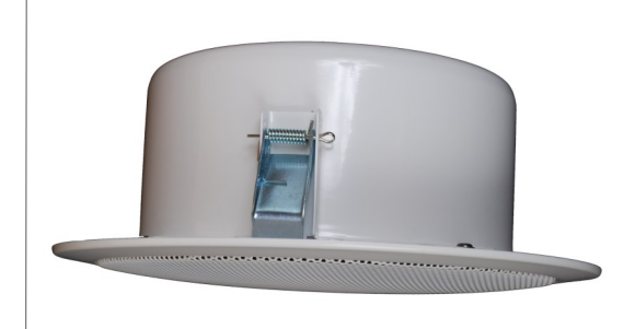
Optional tile bridge: AR-62