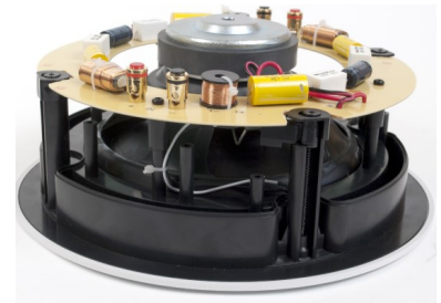
Optional tile bridge: AR-62